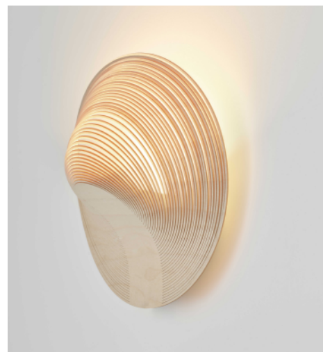
D82A1TW - D82A1T

Reference code: Structure 3000K Available by request. D82A1T 1D82YA1T0599 birch